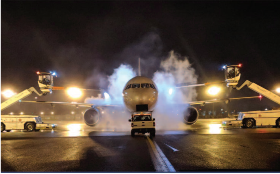
First-place winner in the 2018 IAM Photo Contest was “Early Morning Frost Spray,” submitted by photographer Robert Nolan of IAM Local Lodge 1681. The picture shows IAM members de-icing an Air Canada Airbus A320. The steam around the aircraft is from the Type 1 de-icing fluid heated to 80 degrees celsius reacting to the -20 degrees celsius ambient outside temperature.

Official Publication of IAMAW District Lodge 142